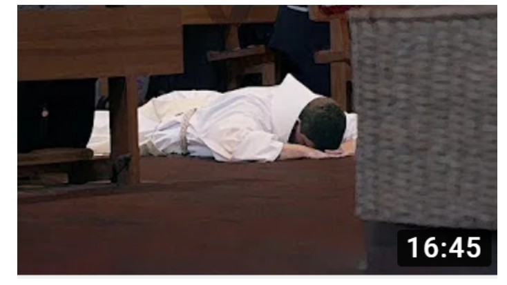
The Day My Life Changed Forever