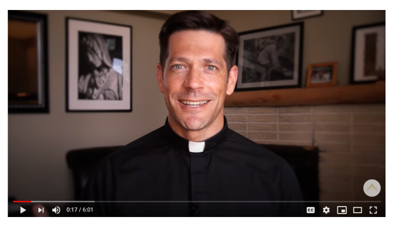
What Does God Want Me to Do?