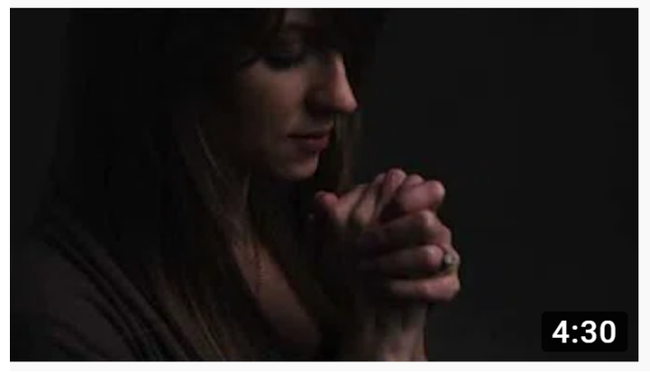
3 Spiritual Exercises to Discern Your Vocation