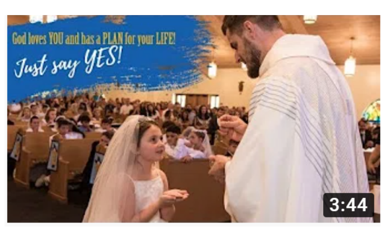
National Vocation Awareness Week